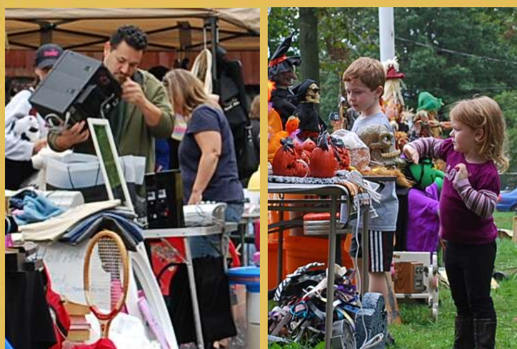
Shoppers of all ages enjoyed the bargains!