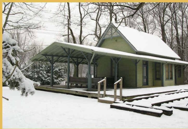
The Wantagh Museum in Winter