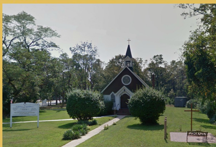
St. Matthias Ministries treated the WPS Trustees to a guided tour of their 1904 church building