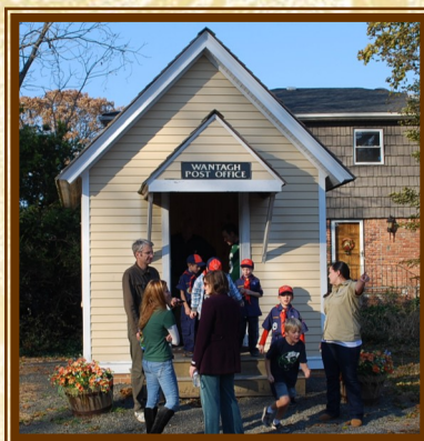
Cubs enthusiastically visit the original Wantagh Post Office