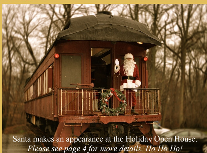
Santa makes an appearance at the Holiday Open House. Please see page 4 for more details. Ho Ho Ho!