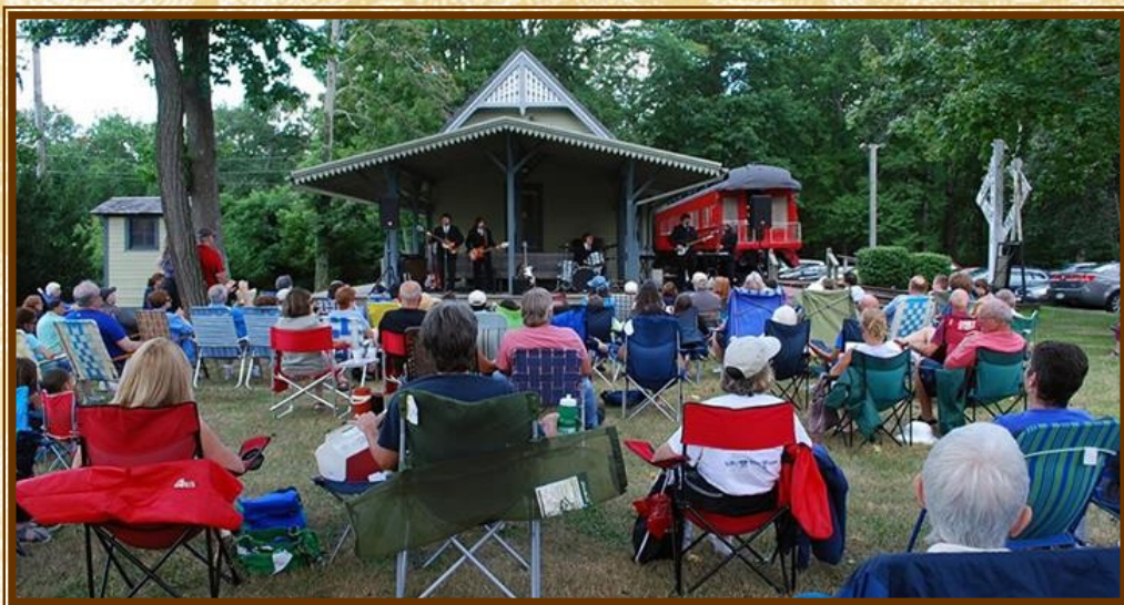
The Mystery Tour performs Beatle favorites on the Wantagh Museum grounds on 2013 August 4

The show concluded with "One After 909" an appropriately-themed tune for the Jamaica, which is undergoing renovation. A special thanks to the Friends of the Wantagh Library that co-sponsored this event with the Wantagh Preservation Society. 📖