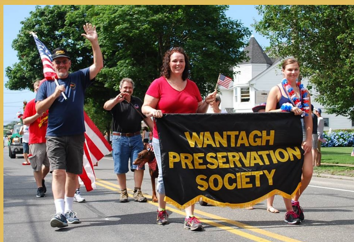
WPS Trustees and Members march in Wantagh's Independence Day Parade on July 4th