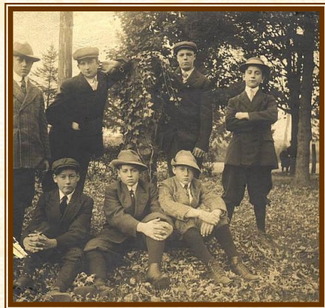
Group of Young Wantagh Men