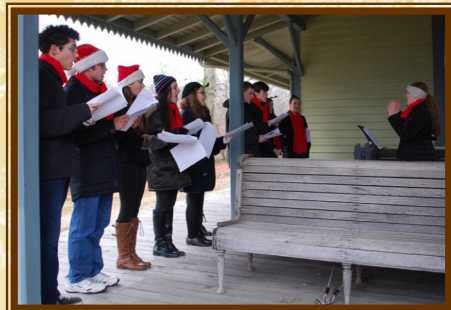
A lively performance of holiday favorites by the WHS Jazz Ensemble