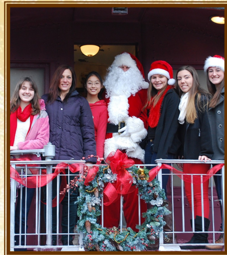
Santa and friends on the Jamaica Railroad Car