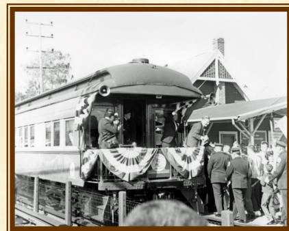
Governor Rockefeller on the Jamaica