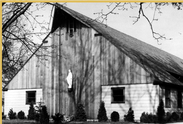
St. Frances de Chantal as it appeared in the 1950's