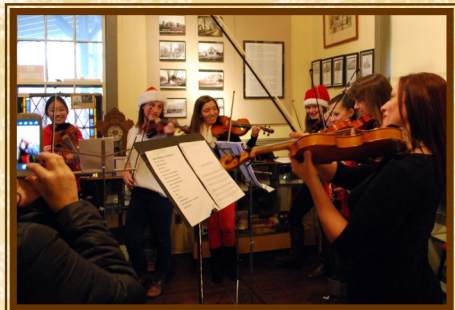
Holiday melodies are brought to life by Wantagh's Symphonic Orchestra students

The chill in the air didn't slow down the WHS Jazz Ensemble, Wantagh's Symphonic Orchestra Students, nor Santa! At the Wantagh Preservation Society's Open House, where all were welcome, the afternoon was full of holiday cheer and surprises.