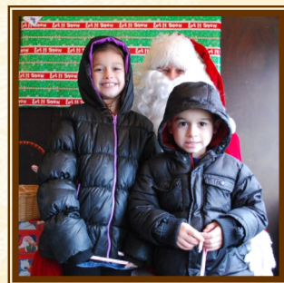
Santa taking Christmas wishes, while figuring who has been naughty or nice