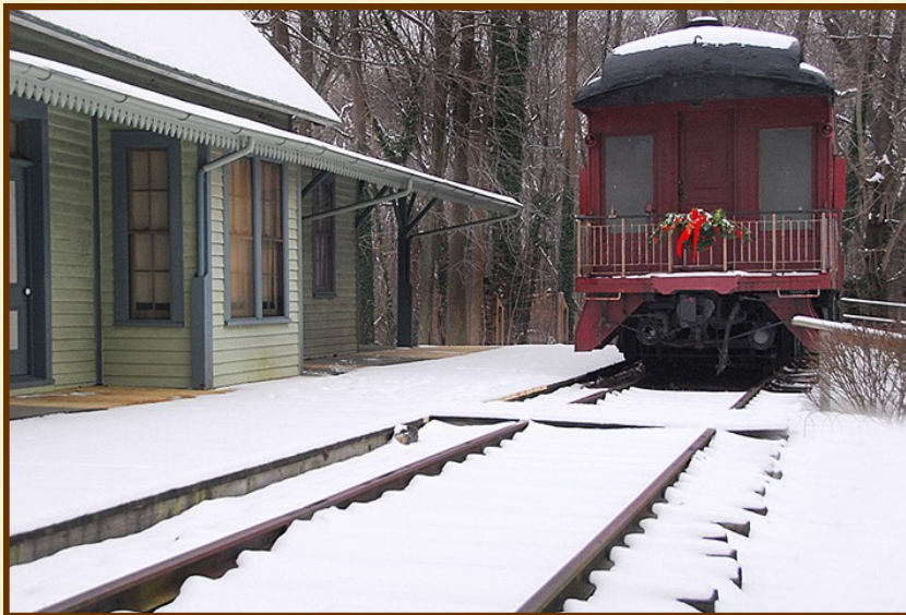
The Jamaica Parlor Car is currently being restored.

Hopefully we can keep the momentum going in 2014 (at a more leisurely pace we hope!) and maintain this treasure of a museum that some visionary Wantaghites started so many years ago.