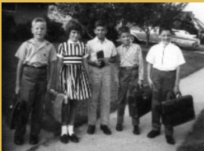
Wantagh children dressed for school in 1962. This photo and many others are part of a heartwarming & heartbreaking journey into our past (please see the page 4).