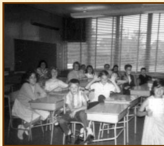
Cherrywood School classroom in 1962 depicting Burt's classmates. Many more vintage Wantagh photos are available on the "God Bless Arthur" page.

For the rest of this bittersweet story, scan or click the QR code.