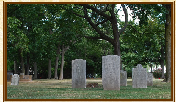
The Jackson Cemetery after Renovations

Christian led fellow scouts in the clean-up of the cemetery grounds. Grass that partially covered fallen headstones was removed. Overgrown vegetation was trimmed while dead bushes and trees were removed. A memorial garden was planted underneath a Town of Hempstead sign, which had been erected in 1976 at the request of the Wantagh American Revolution Bicentennial Committee.