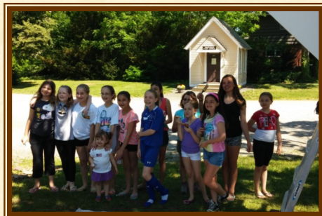
Young Ladies of Scout Troop #3015