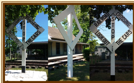
Sign Before, During After Renovation

Next time you're driving on Wantagh Avenue past the Museum, take a look at the sign. I think you'll all agree, it looks beautiful! 📖