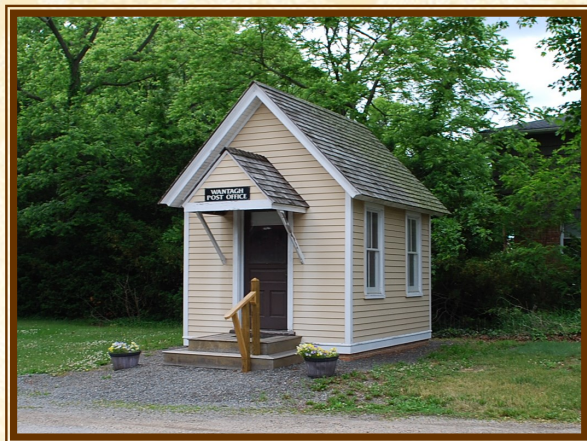
Restored Post Office on the Museum grounds