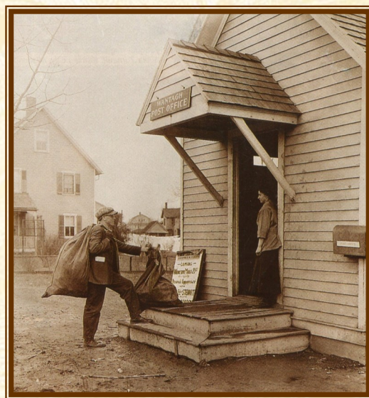
The original Wantagh Post Office on Railroad Avenue, Circa 1910