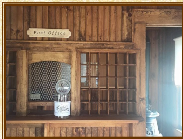
Interior View of the Restored Post Office