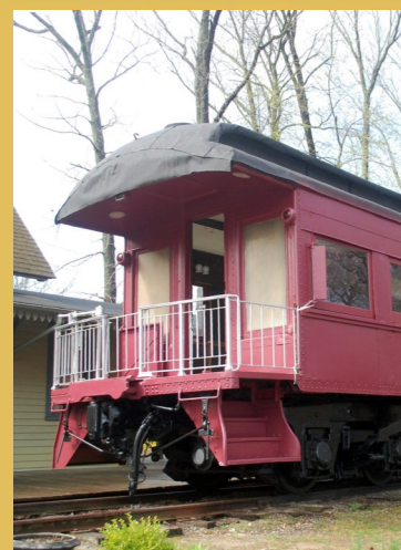
Left Photo: WPS Vice President, Bob Meagher at work securing the side windows. Right Photo: Outside view of the Jamaica as it undergoes restoration.