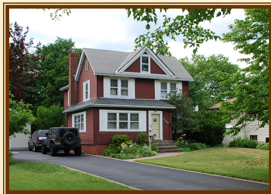
1788 Old Mill Road as it Stands Today