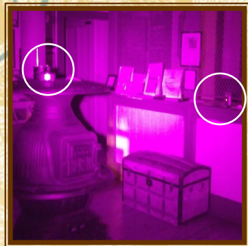
Sensors Placed on the Stove and Counter Inside Museum