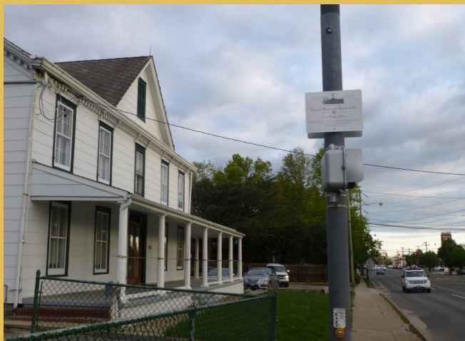
An official Historical Landmark sign was recently installed in front of the Jones-Dengler House at 1051 Wantagh Avenue under Resolution Number 659-2010