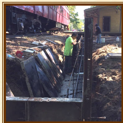
Installation of the Mold

As you drive down Wantagh Avenue past the train museum these days, you can't help but notice a different look to the park itself and a renewed interest in it by the size of the crowds flocking there. For Wantagh Preservation Society, the year 2015 saw a major rehabilitation project, the replacement of the retaining wall surrounding the Jamaica Observation car.