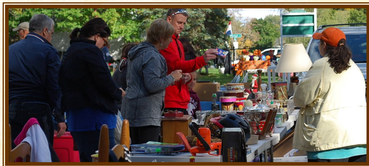
Shoppers Enjoying the Bargains at the Yard Sale