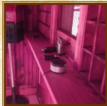
Sensors Placed on Counter at the Original Wantagh PO

The night ended with the results of their investigation of our Museum, Jamaica and Post Office. I was lucky to have been present during both nights of recording they did at the Wantagh Preservation Society. The GPRS set up recording equipment in each building and left it running while the other buildings were actively being investigated. It seems we may have some spirits in the Museum! What sounds like a child's voice talking to his mother was recorded in the Museum while we were in the Jamaica. We'll never know for sure, but perhaps they waited there long ago, returning home to the city after a weekend of fun at the beach! 📖