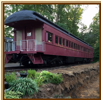
After Removal of the Old Wooden Wall