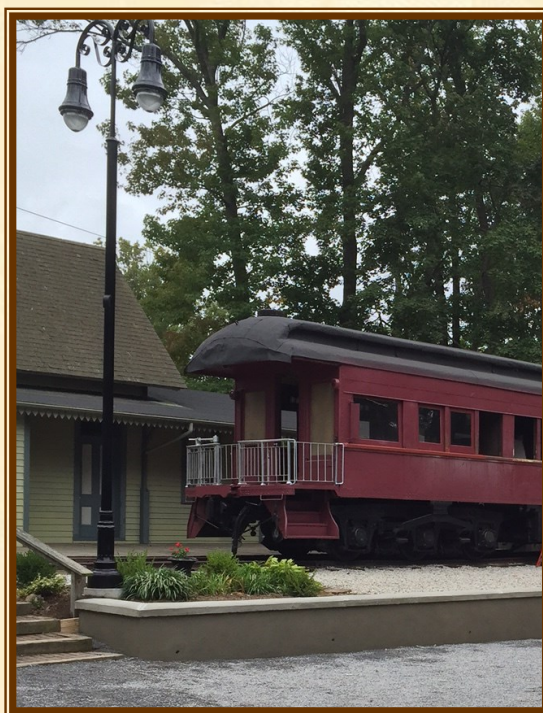
Completed Retaining Wall