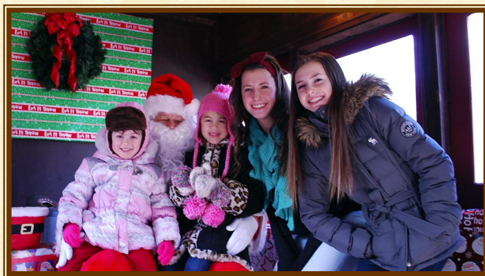
Santa will be at the Holiday open House to take Christmas gift requests from all!