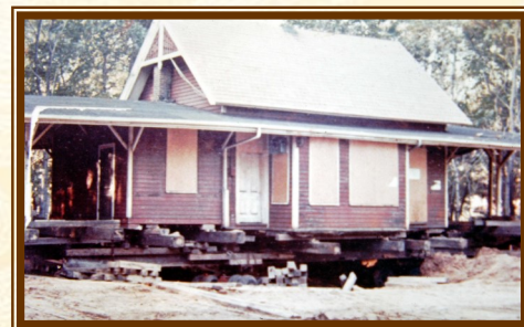
Wantagh Train Station Being Positioned on the Museum Grounds