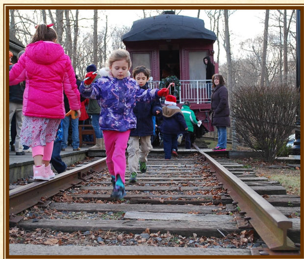
The Holiday Open House is one of those rare occasions where mothers might say "it's OK to play on the railroad tracks"

This event is free of charge and all are invited. 📖