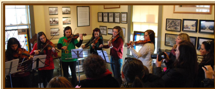
Wantagh High School students performing at a recent Holiday Open House