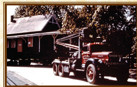
Wantagh Train Station Being Moved Up Wantagh Avenue