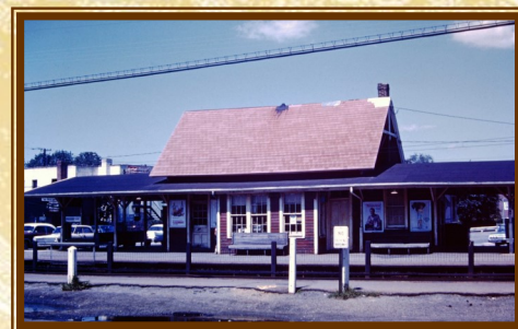
Wantagh Train Station at its Original Location on Railroad Avenue