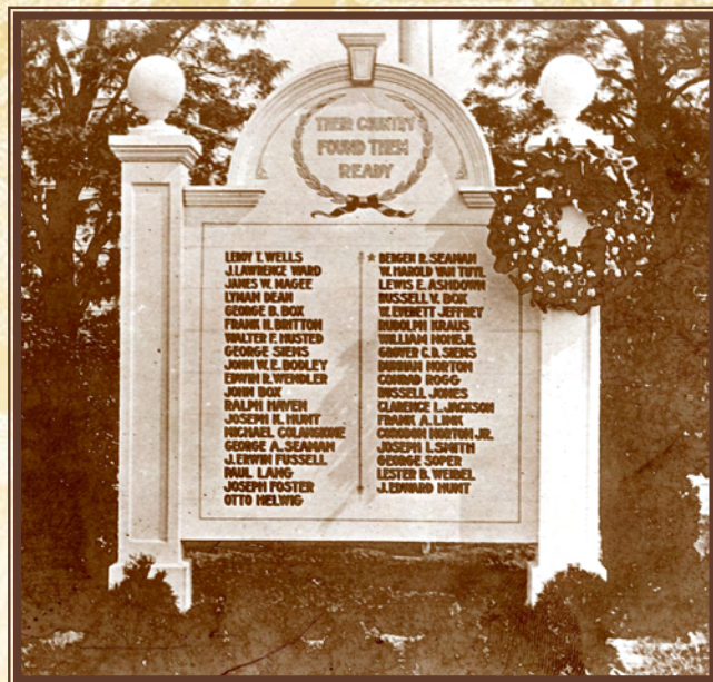
Wantagh's Original World War I Memorial

For convenience, you can donate online by scanning the QR code or visiting https://www.wantagh.li/memorial Thank You! 📖