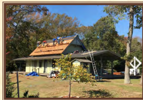
New Roof Installation Underway on the South Side of the Wantagh Museum