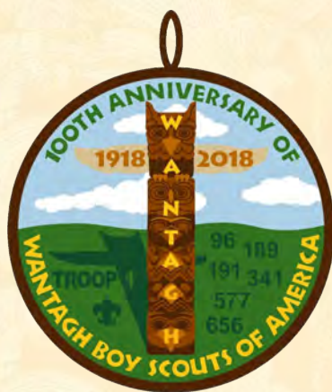
100th Anniversary Patch

Last year, 2017, our Boy Scouts of America (BSA) council, Theodore Roosevelt Council, celebrated their 100th anniversary. Being a history buff, I wondered, "When did scouting start in my town, Wantagh?". Digging in old newspapers, many of which are now online, I discovered that the first BSA unit in Wantagh, "Wantagh Troop 1" was chartered 1918 March 15. Wow, I thought, the 100th anniversary of that first unit is next year! It would be nice to commemorate it somehow. So our pack, Pack 96, which I am the Committee Chairman, made a 100th anniversary float, which we marched with in both the Memorial Day and Fourth of July parades.