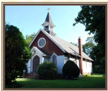
Saint Matthias Church as it stands today