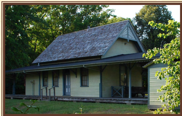
Southern Side of the Wantagh Museum as it Now Stands With its New Cedar Roof