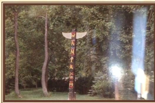
Life-size totem pole created in 1977 by the scouts from Troop 656