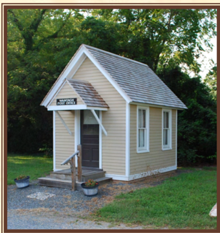
Wantagh's Original Post Office Sporting a New Roof