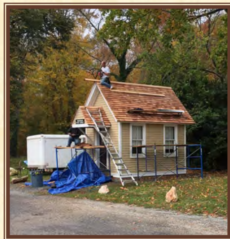
Installation of the New Roof on the Original Wantagh Post Office