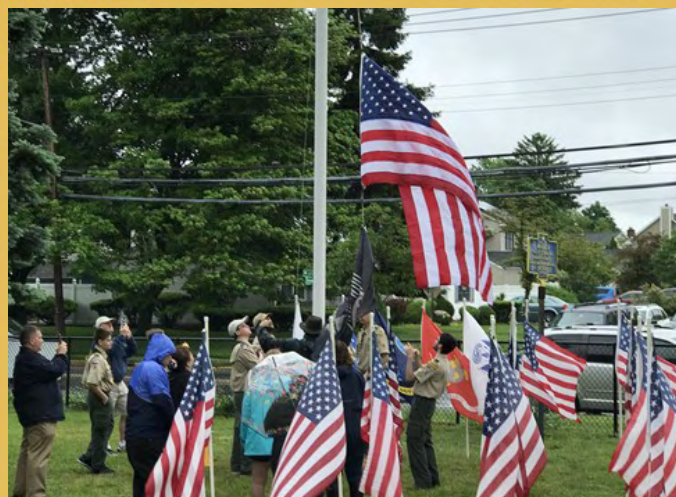
A field of American flags was displayed from May 27 to July 4 at the Wantagh Museum to recognize & honor the veterans who dedicated their lives protecting our freedom. Sponsored by the WPS and the Wantagh 6-12 Assoc.