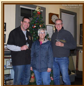
Photos from the 2018 Winter Wonderland Event

Please contact the Wantagh Chamber of Commerce at 679-0100 for a vendor application, sponsor application or any questions. 📖