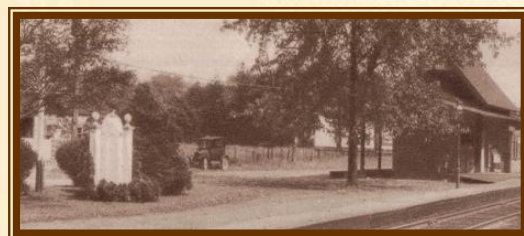
Original WWI Memorial located near the original location of the Wantagh Train Station

Please join us on Monday, November 11. The ceremony starts at 10:40 AM. 📖