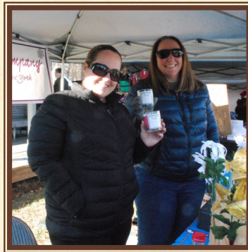
Photos from the 2019 Winter Wonderland Event

Quality, handmade crafted items along with quality non-craft items were available for purchase from various local vendors in addition to food and beverages. Live entertainment was provided by The Five Stone Band, The Wantagh American Legion Pipe & Drum Band, and dancers from Show Stompin' Irish Dance - all while Santa sat cozily in the Jamaica Railroad car taking early Christmas wishes. Topping off the event, was the Christmas Tree and Menorah Lighting. 📖