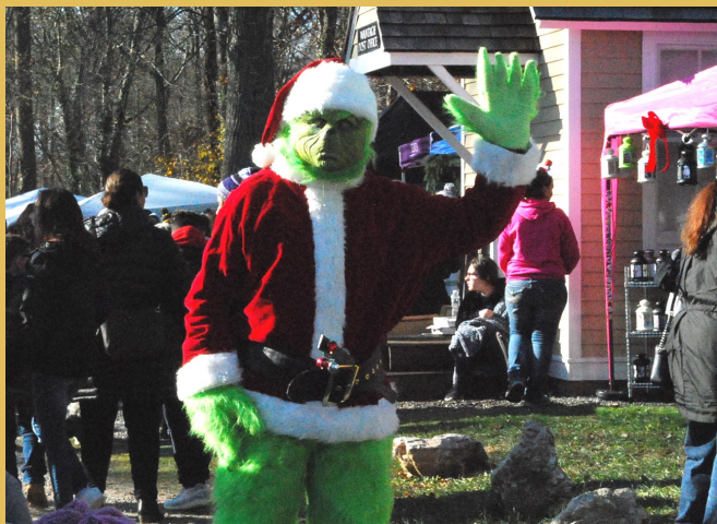
The Grinch cheerfully waves at the Winter Wonderland event hosted by the Wantagh Preservation Society and the Wantagh Chamber of Commerce (more photos on the last page)