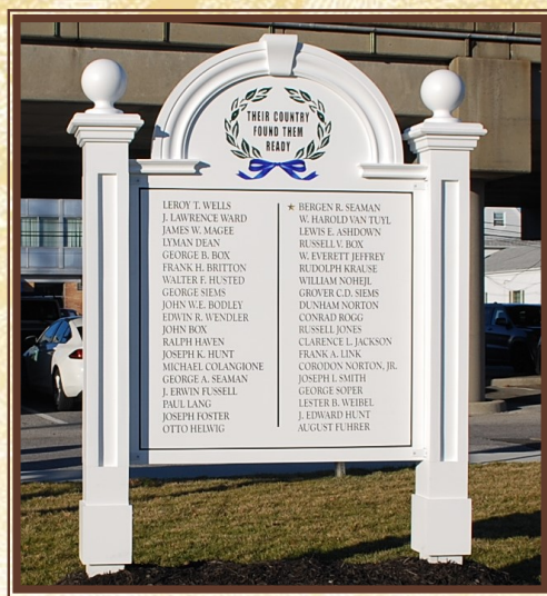
Wantagh's recreated WWI memorial (2019)

Please find time to visit and view the Memorial and to reflect on the names of the men listed. 📖