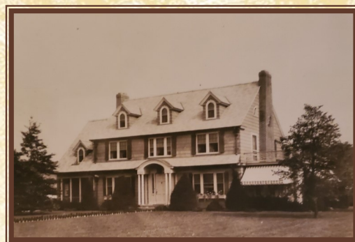
"The Homestead" located at 3171 Elm Place