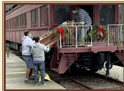
A new Display Cabinet being loaded onto the Jamaica Parlor Car