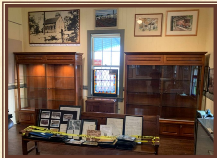
Two new Display Cabinets at the Museum, ready to be filled with interesting artifacts

Thanks to a grant from Nassau County the Wantagh Preservation Society was able to purchase museum-quality display cabinets for the Wantagh train station and Jamaica Parlor Car. The cabinets have been installed and are currently being filled with local historical artifacts for display when the museum reopens.