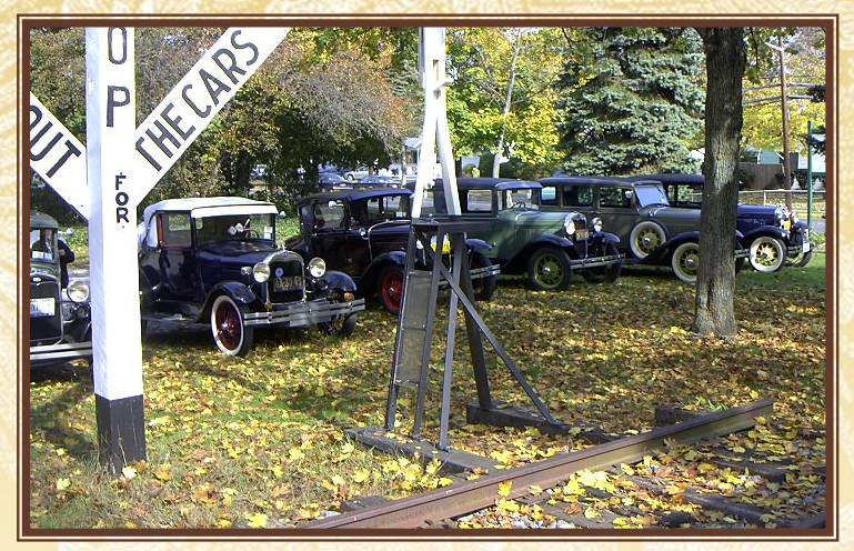
Vintage autos that stopped by the Wantagh Museum provided inspiration for the Annual Antique Car Show

The Wantagh Museum will also be open during the event, so be sure to stop in and check out the new display cases that feature local historical artifacts. You'll also