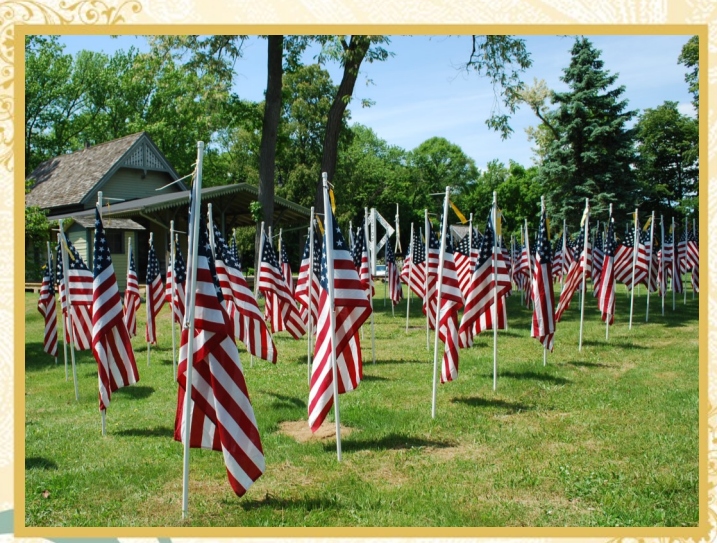
A field of American flags will be displayed on the Wantagh Museum grounds until July 10 to honor the courageous veterans who dedicated their lives to protecting our freedom