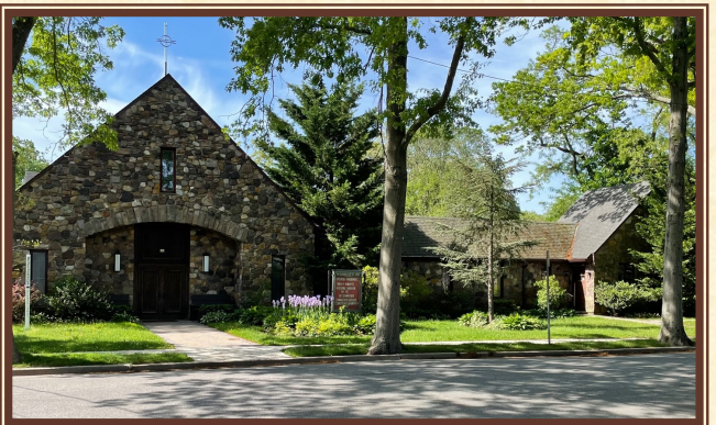
Saint Jude's Church on Lufberry Avenue in Wantagh

(continued from page 1) A second capital fund drive begun in 1989 to build a permanent parish hall and chapel and to renovate the Sunday School wing. Dedication of these buildings took place in 1992 February.