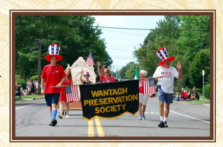
WPS Members at the Wantagh Independence Day Parade

On July 15, the WPS hosted its 2nd Antique Car Show at the Wantagh Museum. In addition to the wide assortment of cars from 1970 and older, a generous assortment of refreshments were offered, like coffee, cookies, hotdogs and ice cream. Plus the entire Museum Complex was open offering all a chance to go inside Wantagh's 1885 Station, Train