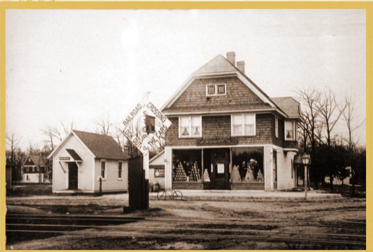
Wantagh's Post Office in 1907 (left) and Fussell's General Store (right), now the site of Mulcahy's

In October of 1976, according to the Wantagh Citizen, the "...Wantagh Republican headquarters..." began operating out of the building. The structure subsequently housed Pickle Packin' Momma's, which sold -- pickles.