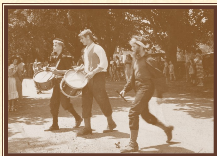
Boy Scout Pack 95 Marching in the Wantagh Fourth of July Parade