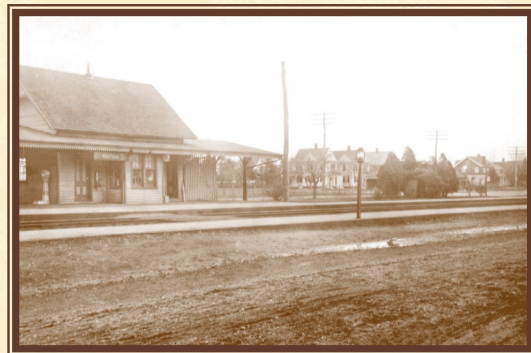
The Wantagh Train Station on Railroad Avenue (circa late 1800s)