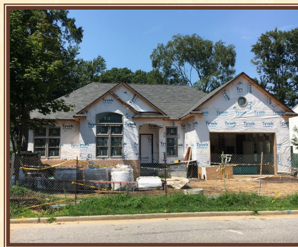
A typical large style home being built in Wantagh Woods after razing a bungalow that once stood there