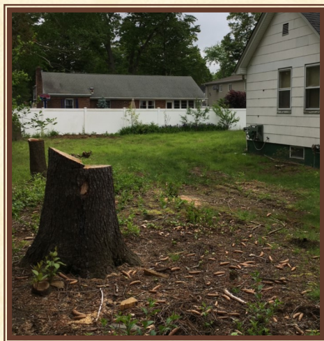
The remaining stumps of majestic trees cleared to make way for a larger home in Wantagh Woods

If you were to drive around the area today most noticeable are the large homes that are built on property that’s just big enough for the dwelling. And maybe one might comment on some of the large trees still in existence on some streets. It wouldn’t be surprising if most people scouting the local assumed that “Wantagh Woods“, was a name created by eager builders selling their latest models.