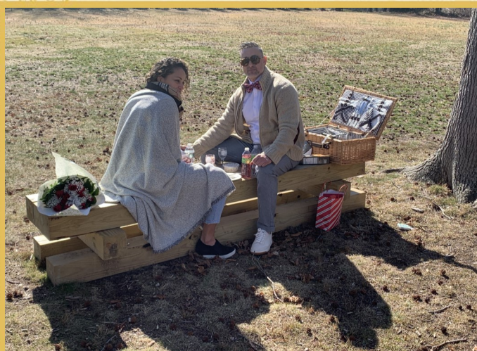
A couple enjoys a picnic on Valentine's Day on the Wantagh Museum Grounds

The Wantagh Museum will open on Sundays, 2 PM to 4 PM, beginning April 16.