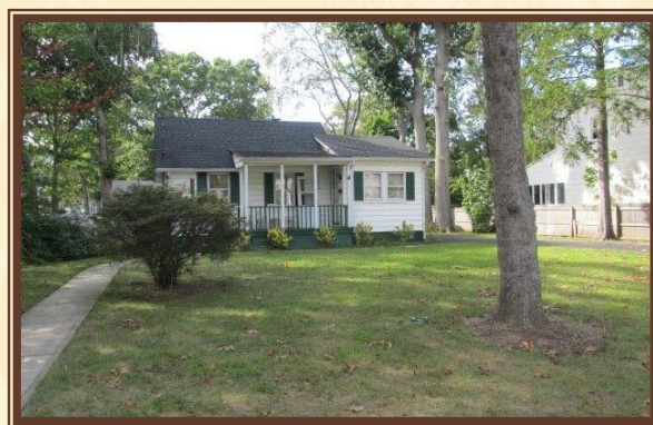
A typical bungalow style home in the Wantagh Woods

Sadly in later decades as the land increased in value, new owners would have the bungalows demolished and build larger more modern homes which usually meant the trees were cut down too. In the last 30 years homeowners have even subdivided their properties which has increased the density of homes in the woods. Fortunately for most in Wantagh Woods homeowners today, the quality of the homes has increased the value of the area, but at the cost of the loss of many magnificent trees of the former woodlands. 📖